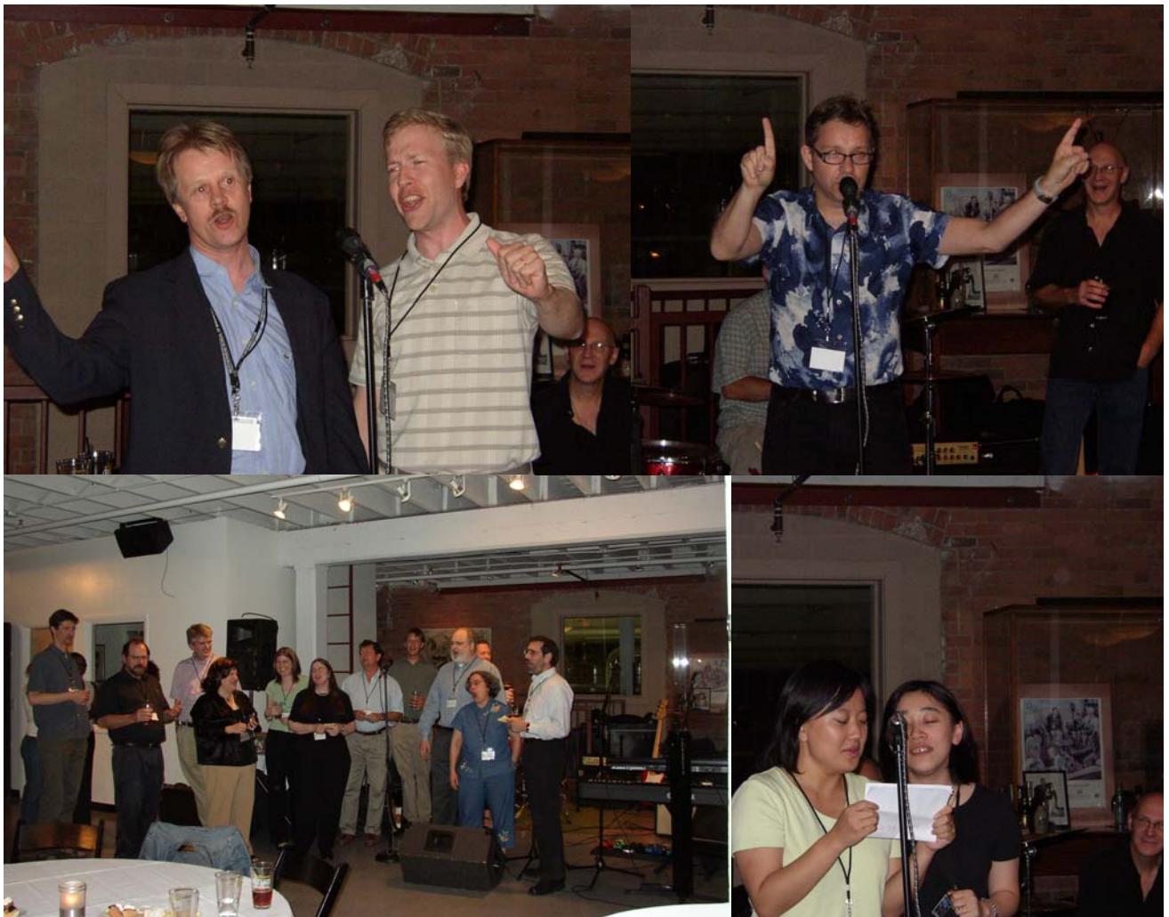
Tradition re-invented: National songs at the social event