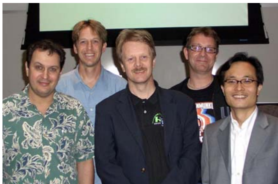
The conference organisers.