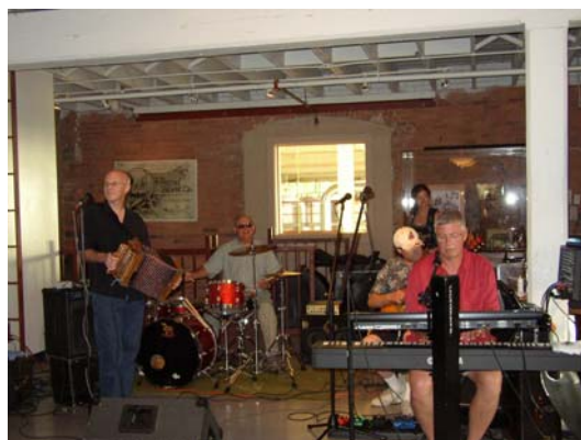
The entertainment at the social event