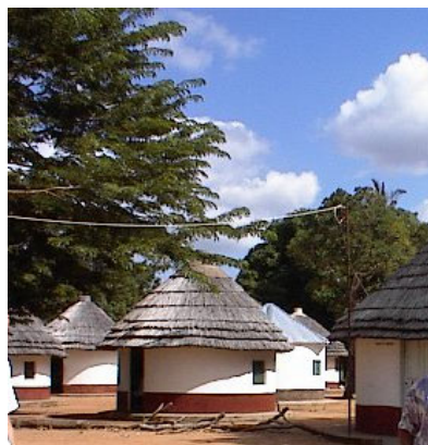
Figure 2. Xai-Xai compound.

Xai-Xai district health office is located 15 kilometers from the provincial capital of Gaza, and has an area of 1749 square kilometers, with a population of 200.896 habitants. This health district comprise of 13 health units including 1 rural hospital, 1 health center and 11 health posts. The rural hospital and the health center which are located in the same geographical boundary serve a population of 74.357 inhabitants. A medical doctor, medical technicians, nurses and midwives staff both the hospital and the health center. However, these entities perform different activities relating to health care, and consequently they have different relations to the HIS. The health center is located in a compound, which consists of many buildings (Figure 2), each typically consisting of one room with a thatched roof (Figure 3), and associated with a particular health program or disease. For example, the three people from NEP sit in the same one-room building, as is the case with the staff responsible for ELAT/ELAL (Tuberculosis and Leprosy programs). There is another room that is the venue for conducting training programs and seminars for health technicians. This room is better equipped than the other rooms as it has a computer, a photocopy machine, a classroom, and a small library. This infrastructure has been donated by the Portuguese Co-operation and Save the Children, and during our stay there we often found this room to be securely locked.