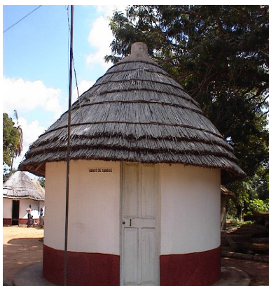
Figure 3. The room housing the NEP.